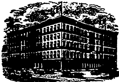
A. NELSON, PROPRIETOR

In point of cuisine and equipment, THE ROSSIN is the most complete, the most luxurious of modern Ontario hotels. The rooms, single or en suite, are the most airy and comfortable in the Dominion. The Union Depot and Wharves but two minutes' walk.