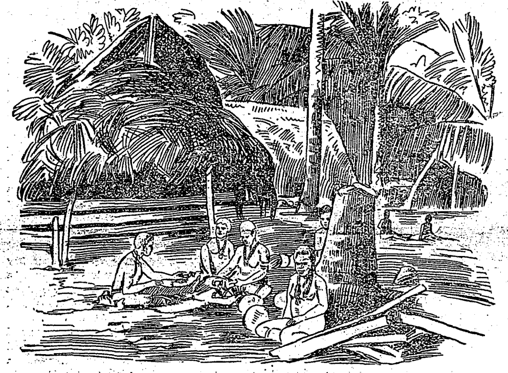
TWENTY-FIVE YEARS AGO,