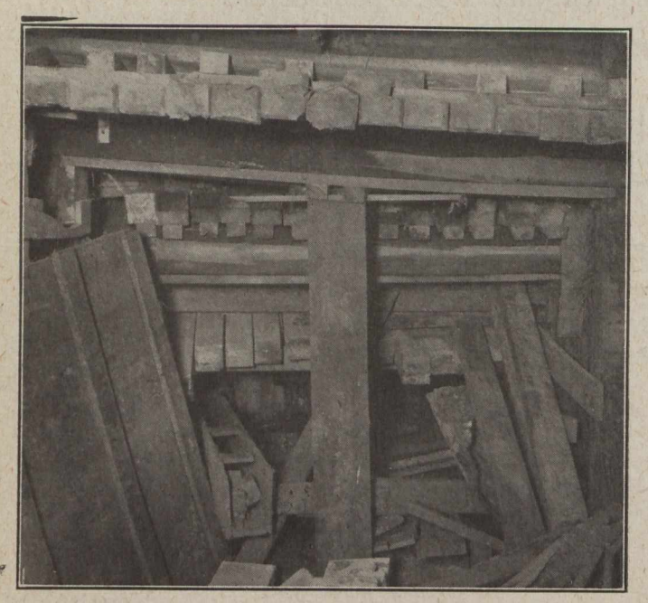
Fig. 2.-Wet Soil Caused Timbering to Sink.

nature of the overhead ground, whether all sand, a mixture of clay and sand or these two occurring in layers. It depends also on whether the ground contains any old sewers, mains, conduits, etc. Roughly, \frac{1}{2} lb. of air to the foot of depth is assumed, but conditions of the ground vary so much that it is never possible to go