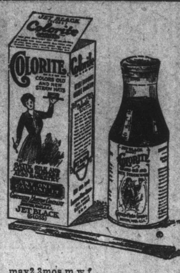
may 2, 3, 6, 8, 11, 14, 17, 20, 23, 26, 29, 32, 35, 38, 41, 44, 47, 50, 53, 56, 59, 62, 65

A meeting of the M.G.C.A. Sports Committee will be held in the club rooms at 815 to-night, when preliminary arrangements will be made in connection with the proposed trip to Grand Falls in July. According to letters received from the Grand Falls Athletic Association, the athletes, and the people in general, are very much