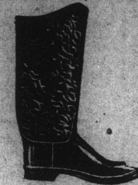
The "CHATHAM"; Women's, Misses' & Child's. Light weight; Bright.