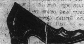
WOMEN'S RUBBERS. Perfect Fitting.