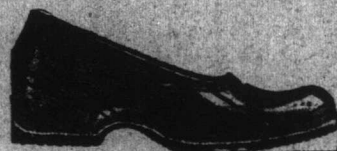
MEN'S RUBBERS Low and Storm; Many Styles.

Complaints Are Cut Out! Every Pair Guaranteed!