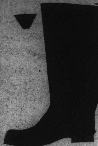
The "BIG KATCHE" Boot; Men's and Boys'; Pure Gum.