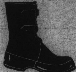
The "DAUPHIN" Men's and Boys; 1 buckle, 2 strap.