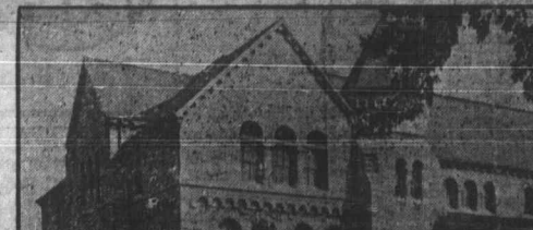
Ontario Hall Containing the Physical Laboratories