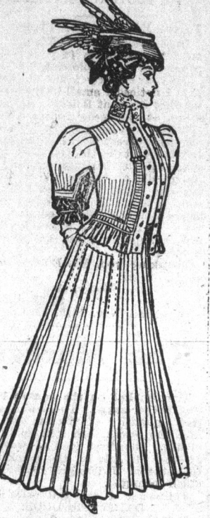
STRIPED CASHMERE SUIT.

Since stripes are so much affected for this fall, nothing could be better for this dainty morning costume than this French cashmere in biscuit color marked with hair lines of dark brown. The blouse is laid in tucks, the tucks being so arranged that the background is most prominent, with the stripes forming a piping, as it were. Each tuck is trimmed with groups of French knots in dark brown silk worked in parallel lines, though separated by three inch spaces. The round neck is stitched with shaped bits of brown taffeta