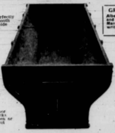
Door locks open or shut

GRAIN TANK PURCHASERS Alberta customers, send your orders and inquiries to our Calgary Office. Manitoba and Saskatchewan customers, write direct to either Winnipeg or Regina