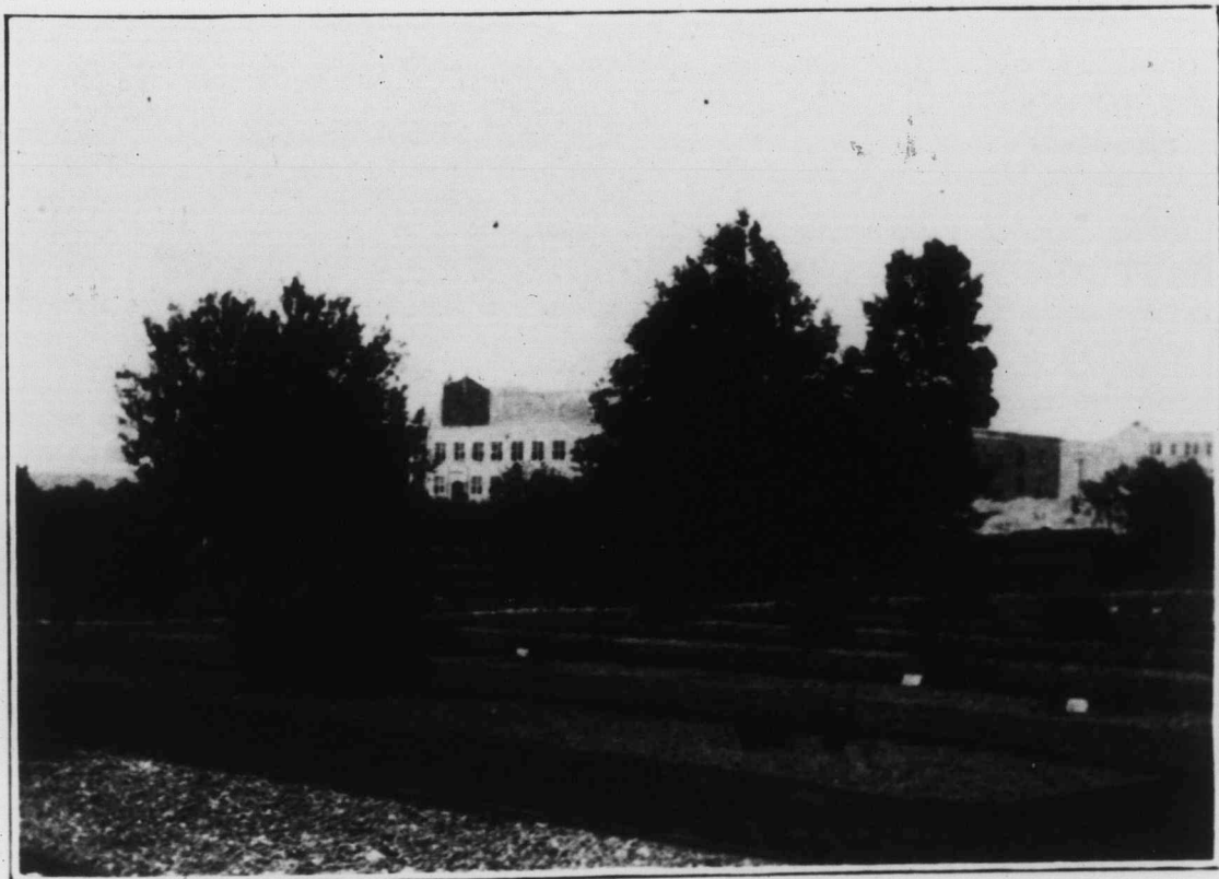
BOTANICAL GARDENS AT UNIVERSITY