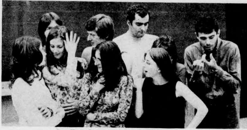
The Company in action.