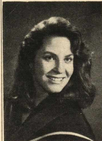
"I voted for JARVIS"