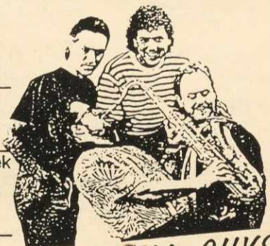
The SWELL GUYS