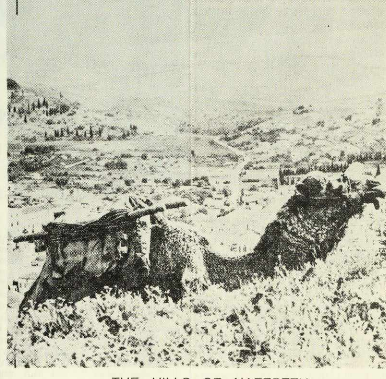
THE HILLS OF NAZERETH

And as we all know, whoever wins, AT LEAST IT WILL BE A PRESIDENT WITH HAIR.