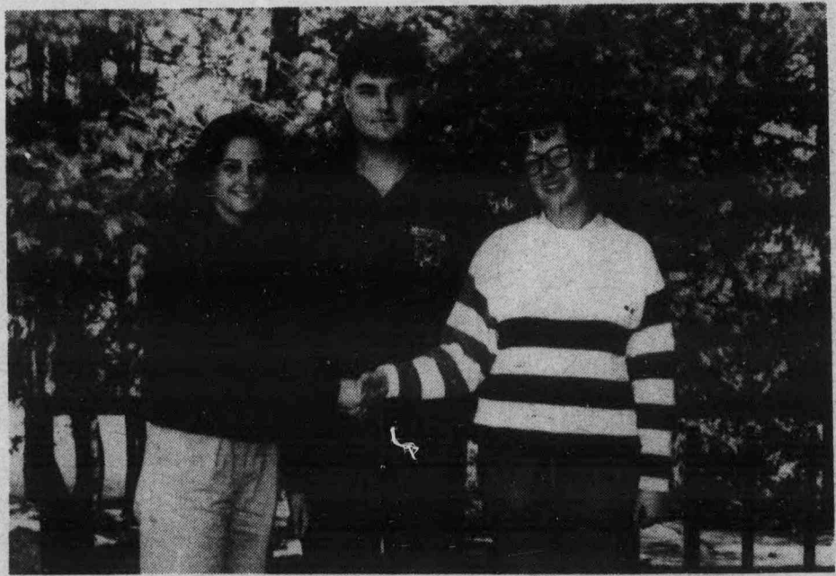
Here are the weekly winners of the "Spot the Buttons" contest.