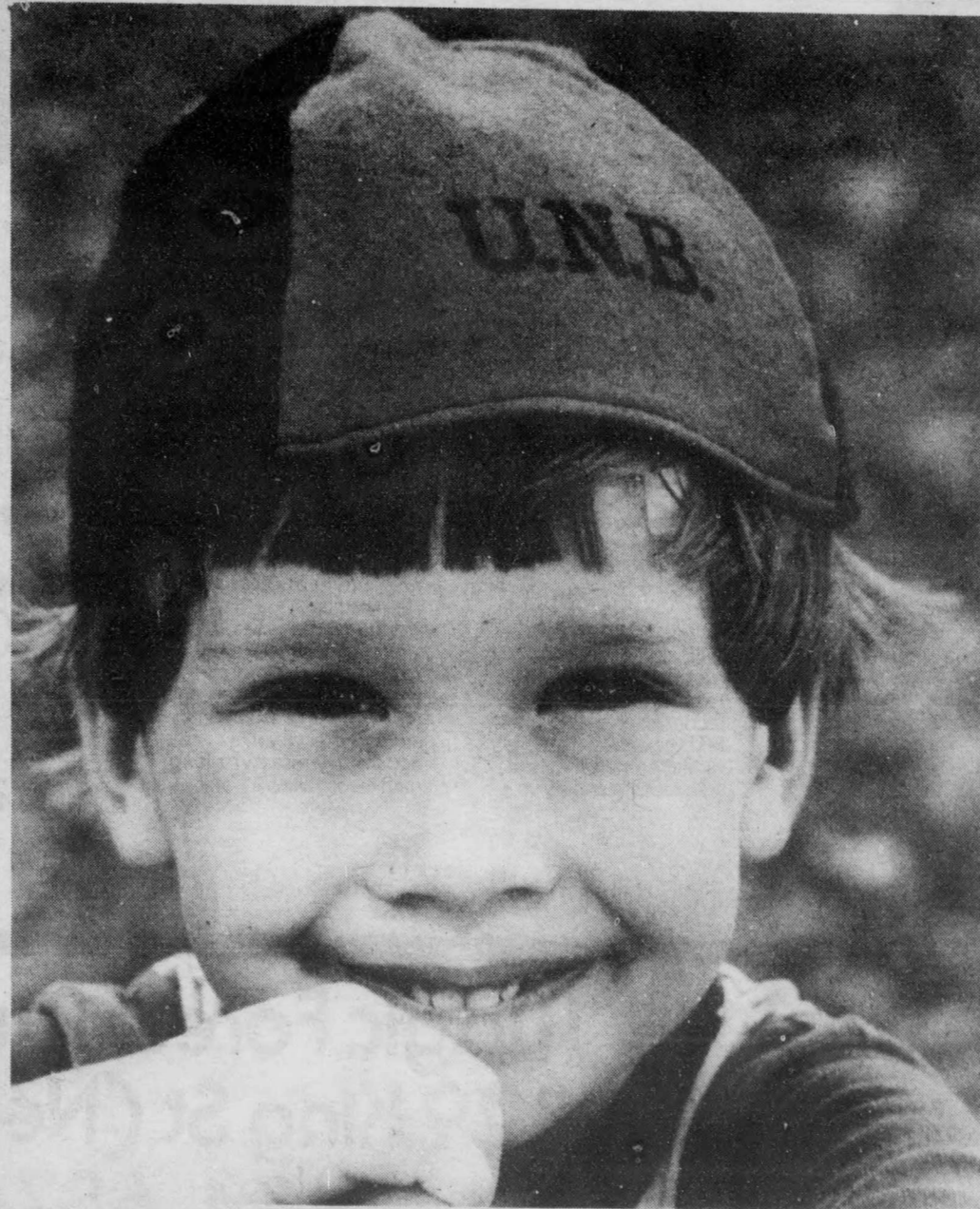
Frosh: they're getting younger every year