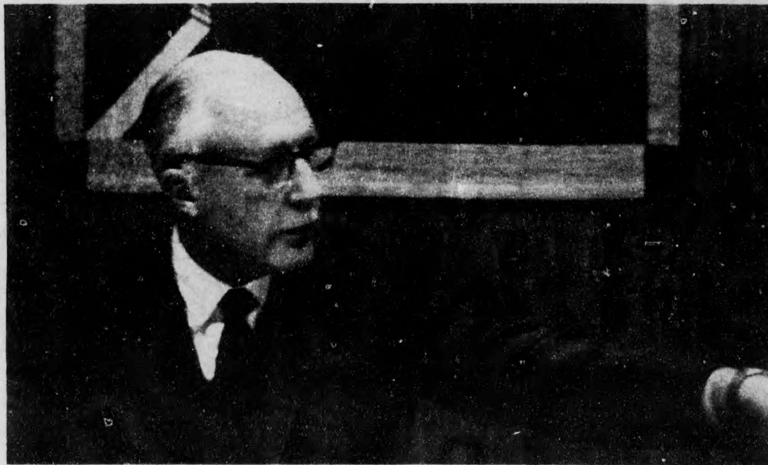
"The student loan is only a supplement to the needy student. Financing of education is the basic responsibility of the parent."