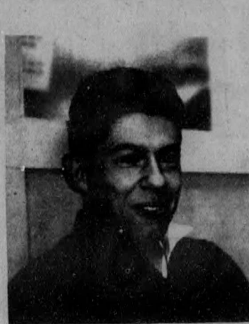
"I am running now primarily for my own enjoyment."