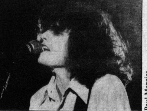
Grapes of Wrath...

Folks, it doesn't get any more live, powerful, or direct than it does in the underground! Playing for nearly an hour and a half, Government Issue proved that there is something different to be had in the way of entertainment in this town for those willing to look hard enough for it.