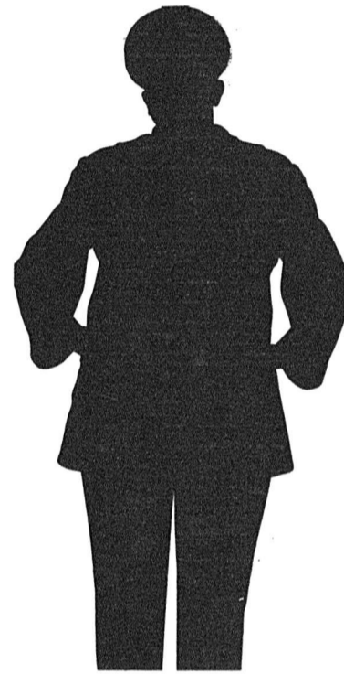
AUTHORITY WINS ... this time

front door entrance were led through a cordon of about 20 police, photographed by police, then allowed to go their way.