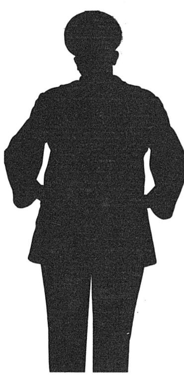
AUTHORITY WINS . . . this time

front door entrance were led through a cordon of about 20 police, photographed by police,