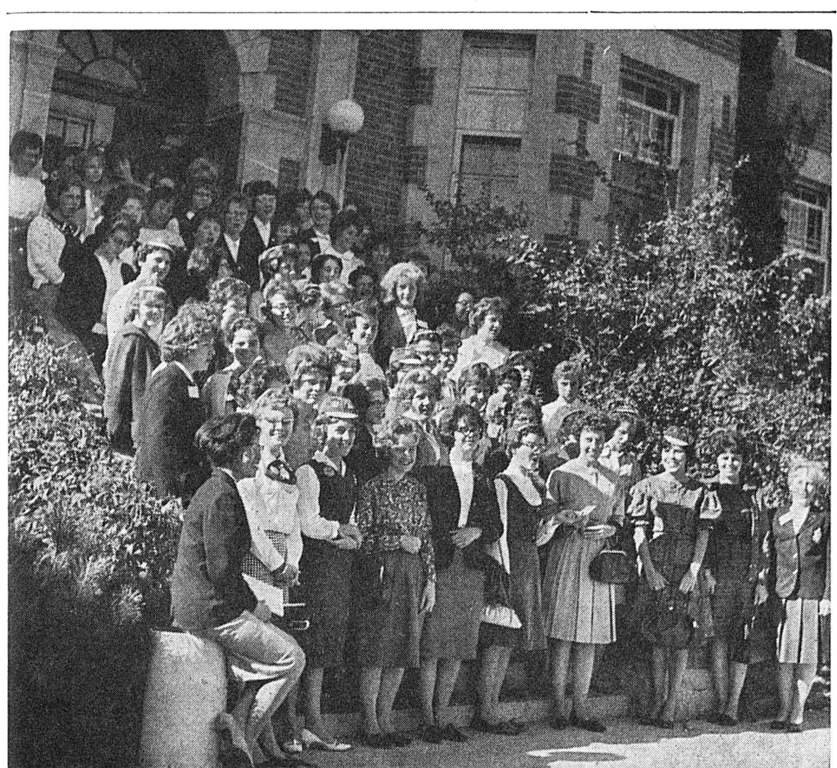
MASS assembly of new Pembinites sing for their supper on the front steps of Home.