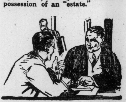
His tendency to save and invest is noted