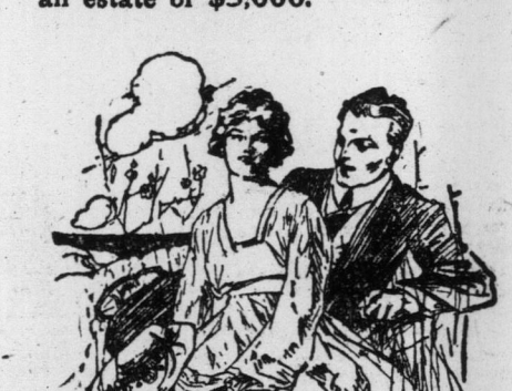
He improves the shining hour and impresses upon an important person that he is in