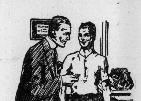
He takes his first step in business affairs, is examined by the doctor, and creates an estate of $5,000.