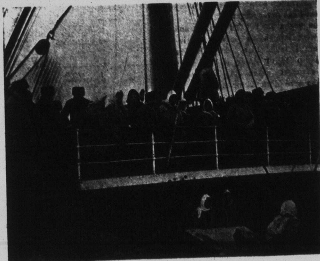
ARRIVAL OF THE DOUKHOBORS.