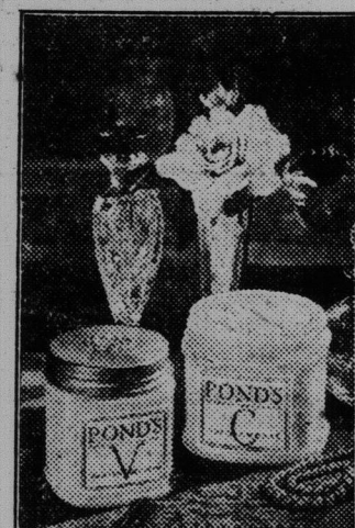
THE TWO CREAMS the Younger Set is using

After every such cleansing except the bedtime one, apply Pond's Vanishing Cream to your skin. It gives you a soft, even finish, a freshened, velvety look—and your powder goes on better and stays longer with this delicate Cream as a base. Furthermore Pond's Vanishing Cream acts as a protection against weather, dust and soot. The Pond's Extract Company, 146 Brock Avenue, Toronto, Canada.