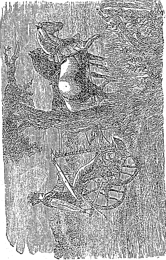
"Haymaker" or New Champion Mower passing an obstruction without stopping the Knives.

At the Great Trial of Single Reapers at Grignon, France, 1878, before the best Expert Agricultural and Mechanical Authority of the World, the CHAMPION was pre-eminently the Victor. We give below an Extract from the Report of the International Commission who made the test, as to the comparative merits of the several machines:—