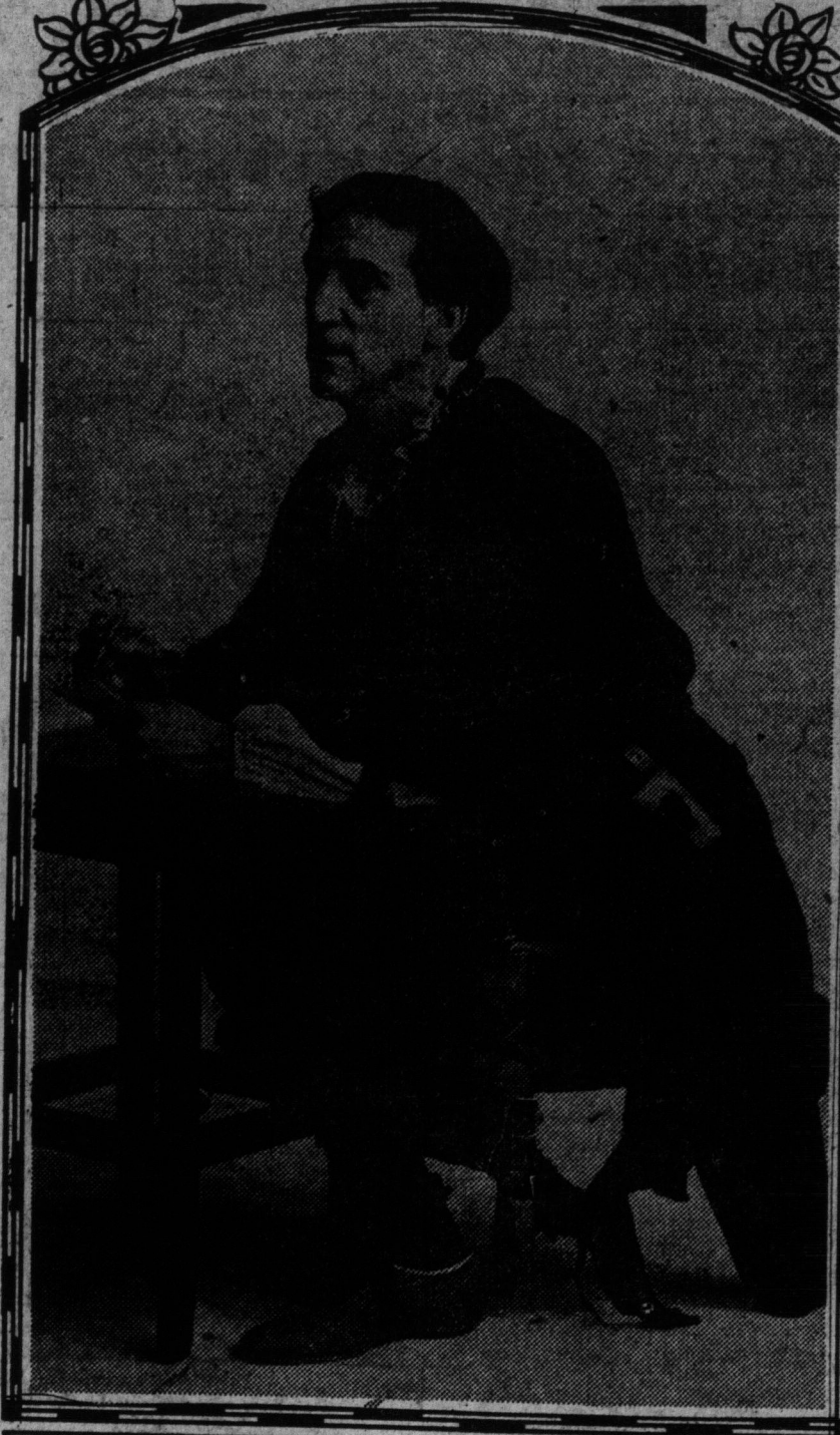
F.R. BENSON AT THE PRINCESS