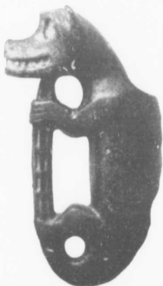
No. 5. Upper Iowa River.

No. 5. This is an animal pipe made of diorite or greenstone of about 5 inches in height, well-polished and finished. Is symmetrical and every detail brought out with a skill that seems marvellous, if the sculptor had not tools of steel. It was found by a Dr. Ratcliffe, former resident of Waukon, Iowa, in a grave on the Upper Iowa River. This grave was one of a group of graves, opened at different times during the period of 1895-98, and which produced no relics showing contact with white man, though other graves in the same valley produced some. This group of graves was of the type of the ordinary graves of that section. See letters from Mr. Ellison Orr, Waukon, Iowa, June 9th and June 30th, 1915.