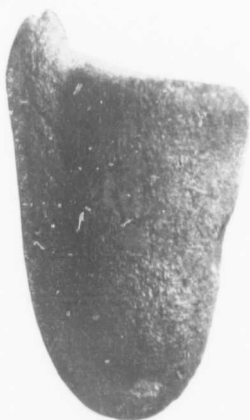
No. 4 (a). Essex Co., N.J.