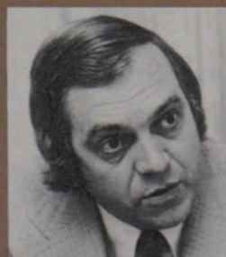
Edward Broadbent New Democratic Party