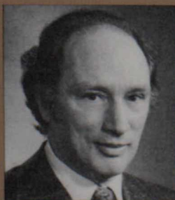
Pierre Trudeau Liberal Party