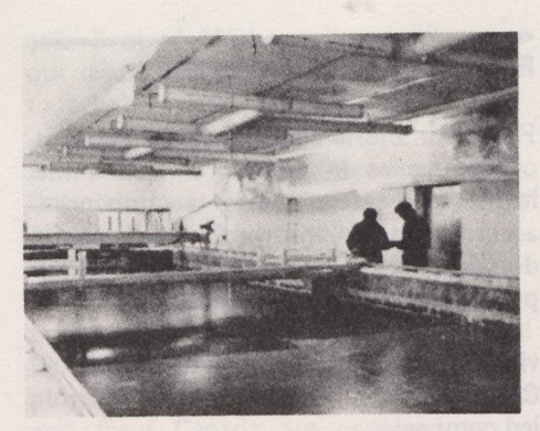
Various simulated Arctic ice conditions created at Arctec Canada's Kanata, Ontario laboratory enabled engineers to test the design for Polaris' dock facility.

The accommodation building for Polaris will be built in sections, under the cover of a huge shell. A shell the size of a gymnasium will be used to protect the construction crew from the harsh Arctic winter. As construction progresses the shell, built on tracks, will move to become