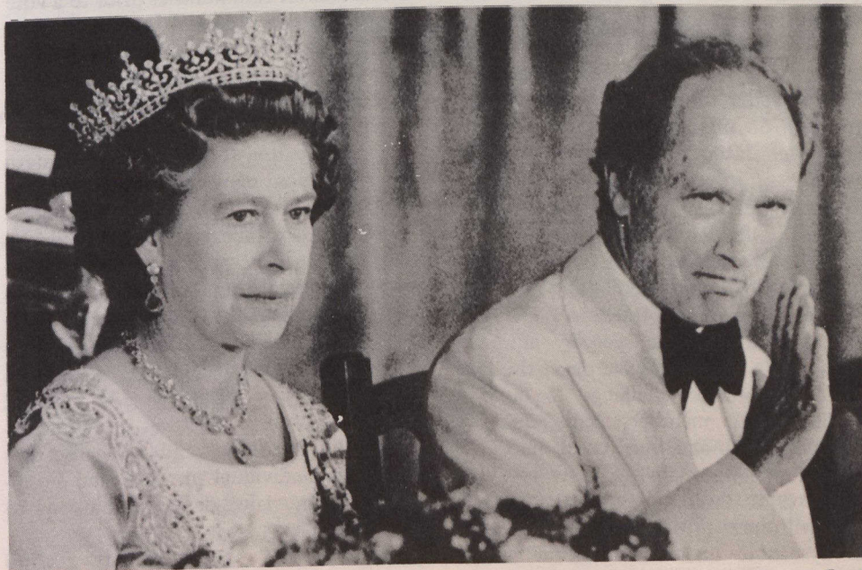
Prime Minister Trudeau waves to guests at formal dinner in Edmonton on August 5, at which he and Queen Elizabeth addressed Canadians from coast to coast.