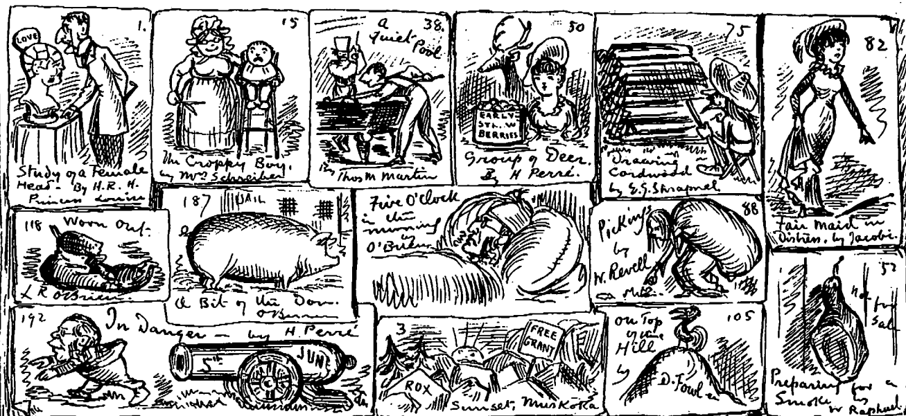
THE GEMS OF THE ART EXHIBITION—WITH MANY APOLOGIES TO THE ONTARIO SOCIETY.