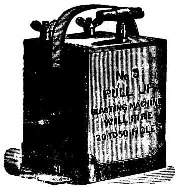
SEND FOR CATALOGUE.