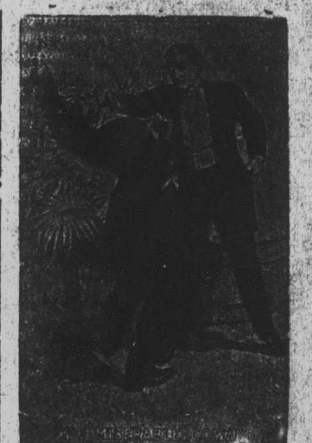
Scene from "Just Plain Molly" at the Opera House Monday Night.