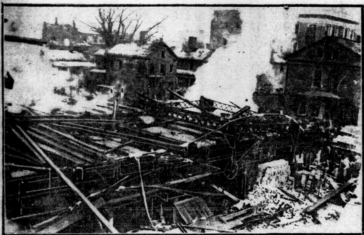
Three were killed and scores injured when a gas tank at Springfield blew up. The explosion rocked the whole city, crumpling up dwellings like houses of cards.