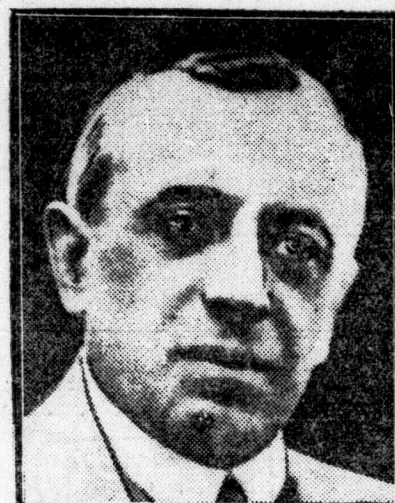
Fritz Thyssen, one of the German coal operators in the Ruhr, who was tried for conspiracy by the French and fined.