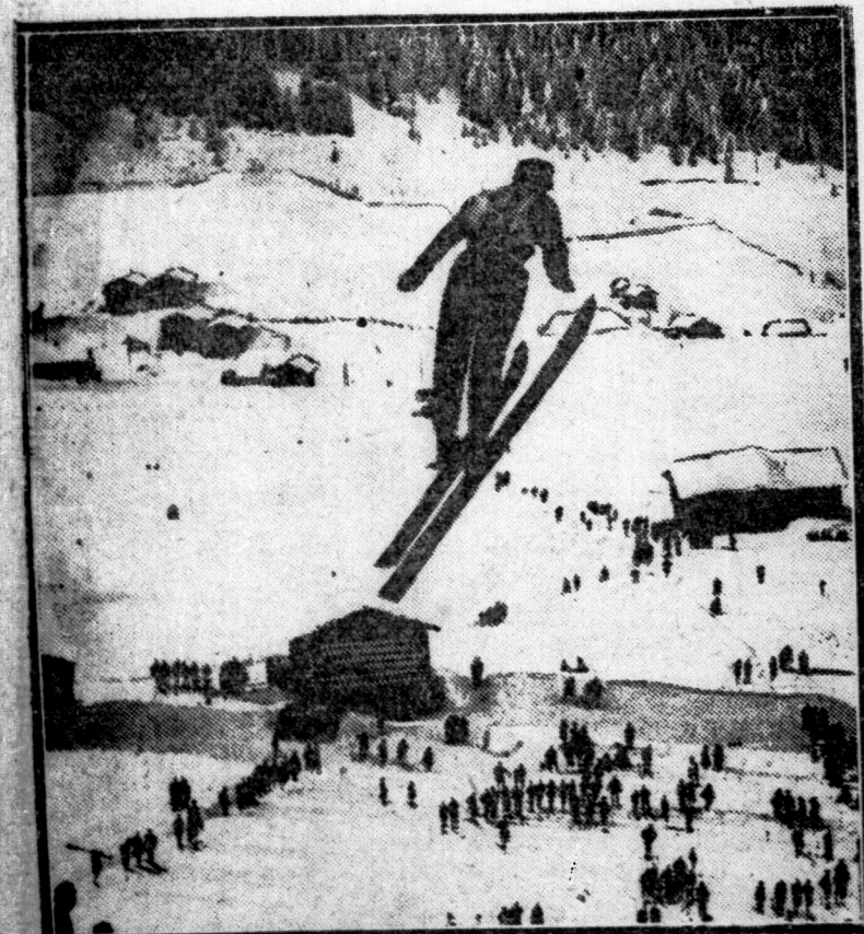
A competitor in the ski championships at Klosters, Switzerland, making a mid-air jump.