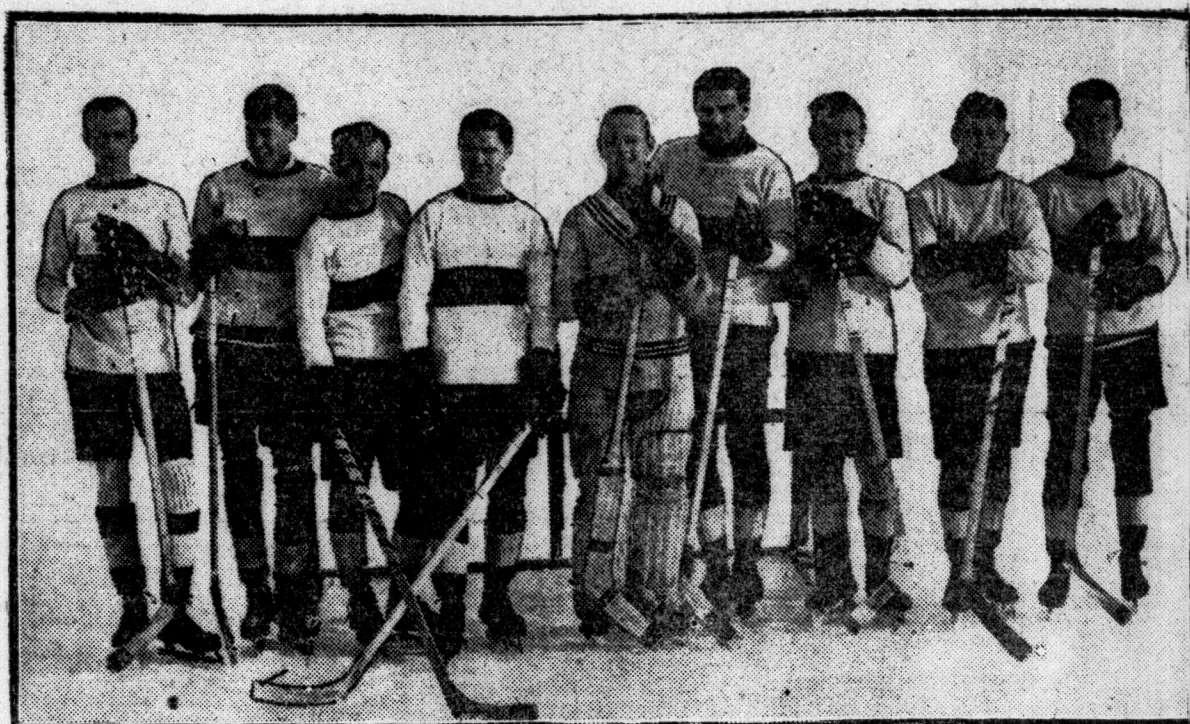
The Oxford hockey team which has just returned undefeated from a tour of Europe. It is composed largely of Canadians, including graduates of Toronto University.