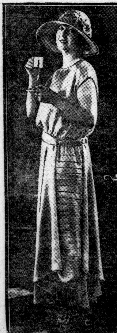
The very latest in dinner frocks. It is of kitten's ear satin and has one side of the skirt tucked from waist line to hem.