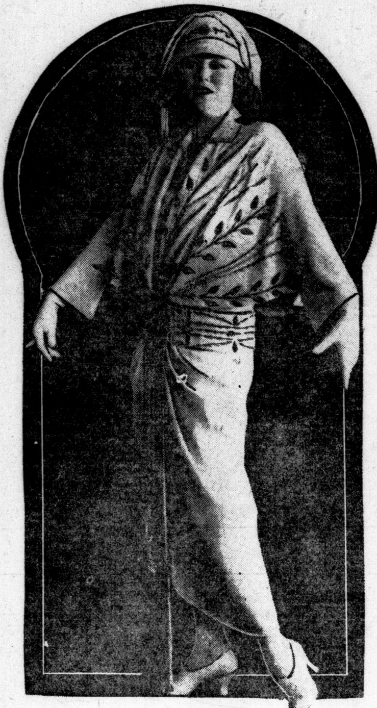
A street costume of Egyptian design. The stone ornaments used in the embroidery are reproductions of specimens recently removed from the tomb of Tutankhamen.