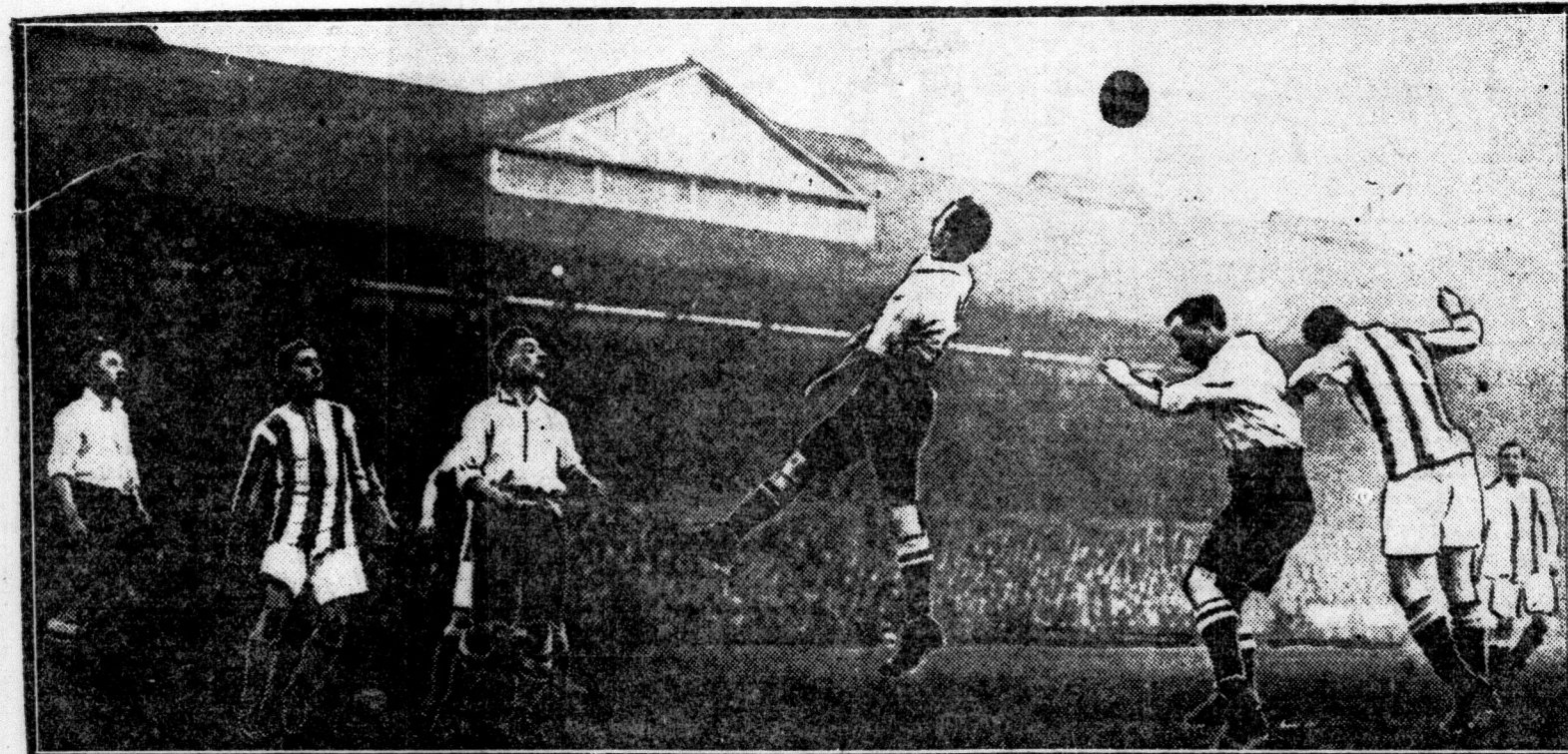
An unusual snapshot of an exciting moment in the second cup tie game between Corinthians (in white shirts) and Brighton and Hove. It was found necessary to play three games and Corinthians were finally beaten.