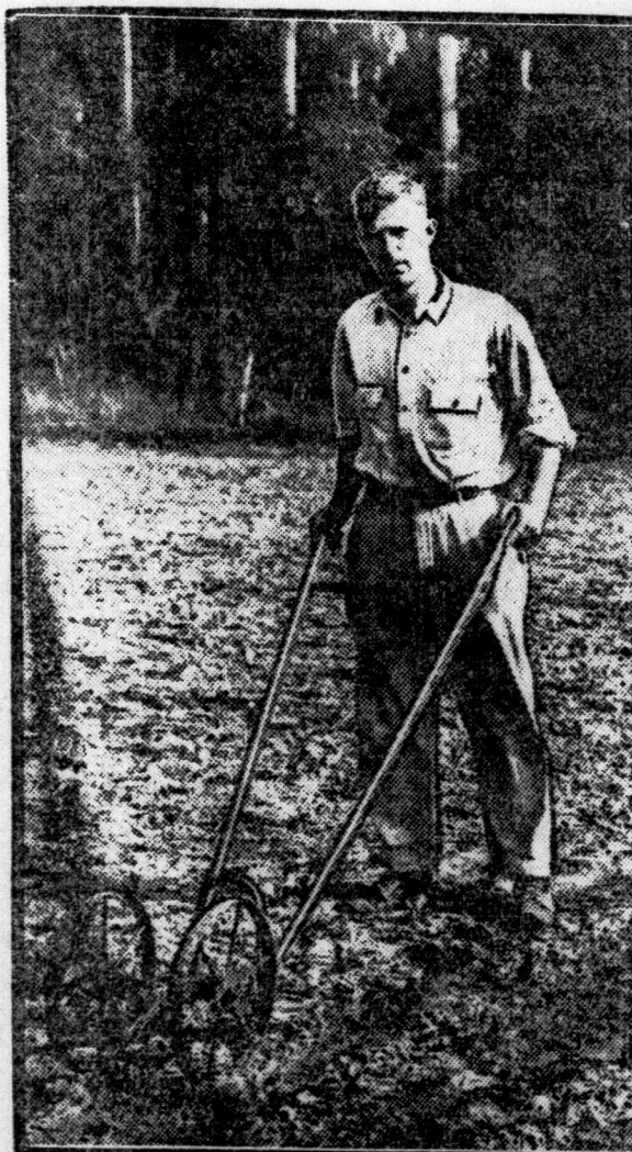
Fred Merkle, famous baseball player, spends the winter cultivating grape fruit.