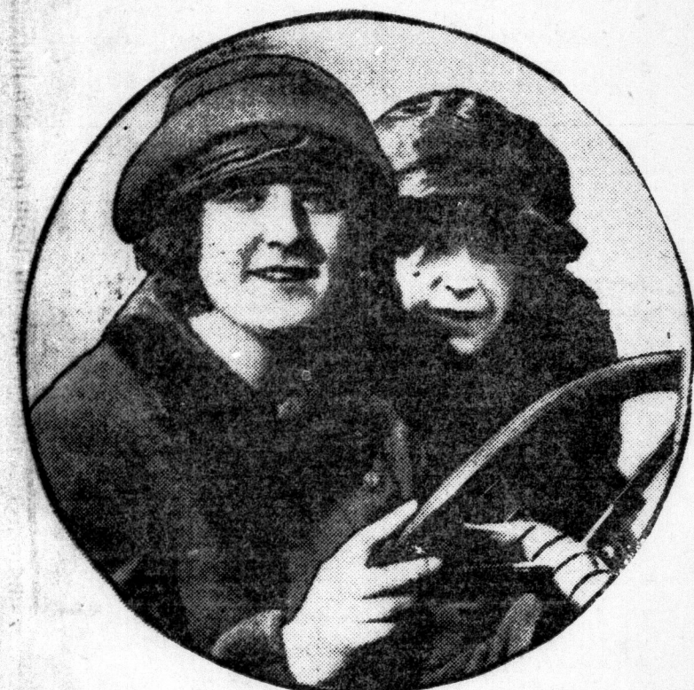
The Marchioness of Queensberry photographed with her mother just after completing a 12,000 mile drive from Boulogne to Rome.