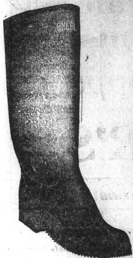
"EXCEL" Made 'All in One Piece'