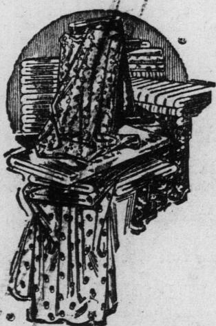
TABLE LINENS. (White and Blue Damask.) 45 inches wide. Reg. 25c. yard. Sale Price 22c. 45 inches wide. Reg. 30c. yard. Sale Price 26c. 54 inches wide. Reg. 40c. yard. Sale Price 35c. 56 inches wide. Reg. 50c. yard. Sale Price 44c. 70 inches wide. Reg. $1.25 yard. Sale Price $1.05

WHITE BUTCHER'S LINEN. 40 inches wide. Reg. 30c. yard. Sale Price 26c. 38 inches wide. Reg. 35c. yard. Sale Price 30c. 40 inches wide. Reg. 40c. yard. Sale Price 35c. 40 inches wide. Reg. 50c. yard. Sale Price 44c.