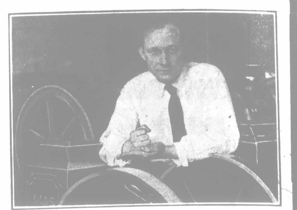
"I guarantee every Olds Engine that leaves the factory to be in perfect running order. I do not spend much time in the office I am out in the shop with my coat off watching every detail.

these repairs without any delay. They do not have to consult me. Write to my nearest agent. He can fix you out with the best engine you can buy, no matter what others cost.