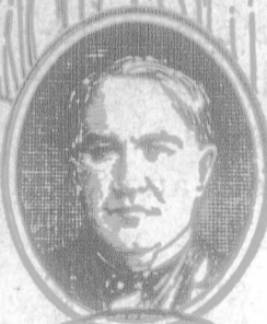
Thomas A. Edison

Outfit No. 89 New Model Instrument and handsome record cabinet complete—two pieces. An entire phonograph outfit, just like the very highest priced instruments, and at one-fifth the price. Cabinet finished in dull brown oak to match the instrument. Capacity 80 records. Height of outfit complete, 62½ inches, width 18½ inches, length 17 inches. Price complete, with 12 Blue Amberol Indestructible 4-Minute Records, $89.00. (See terms in coupon.)