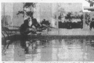
The spectacular indoor swimming pool and solarium lounge at Woodlands Manor