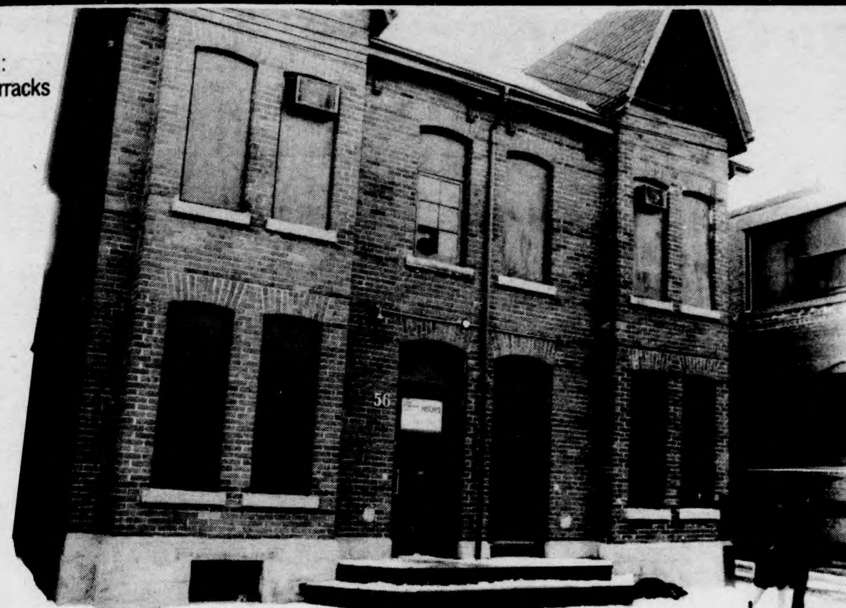
at right: The Barracks