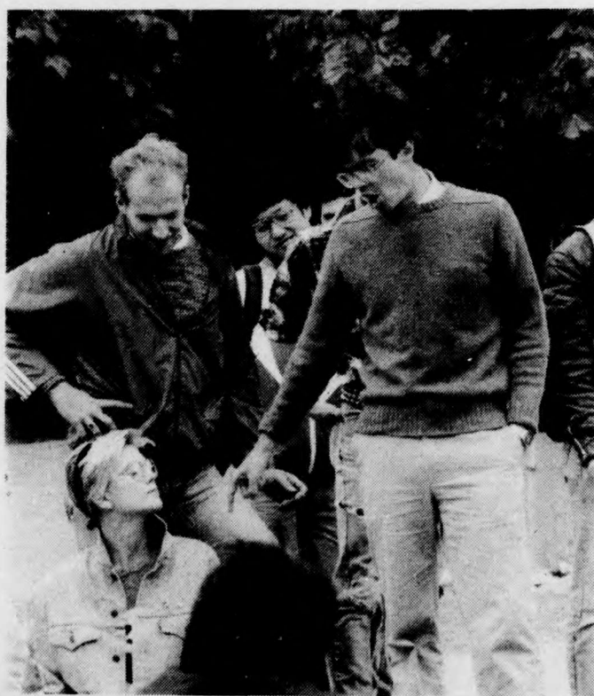
Pictured above, a lay preacher who gave York students an impromptu lecture in October on God's intention to punish gays with AIDS.