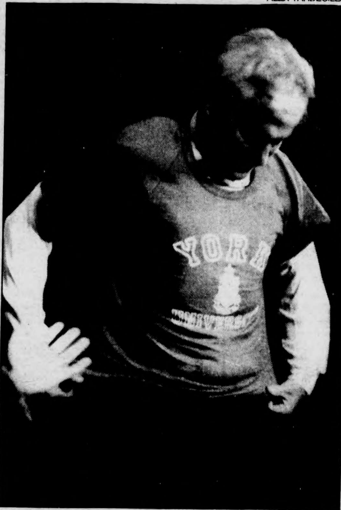
presented to him by York Liberals last Friday at ...

Turner spoke to York students, campus Young Liberals, the local and national media at Osgoode Hall Law School's Moot Court. Adopting the rhetorical style of his predecessor, Pierre Trudeau, Turner followed his brief opening remarks with an invitation to audience members to ask questions.