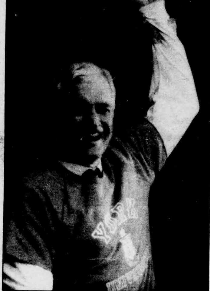
Osgoode Hall. Turner emerged the victor this time around.

Although weather forecasters were predicting the storm would continue through today, dumping up to 20 more centimetres of snow, the weather unexpectedly cleared late Tuesday night. York reopened yesterday morning.