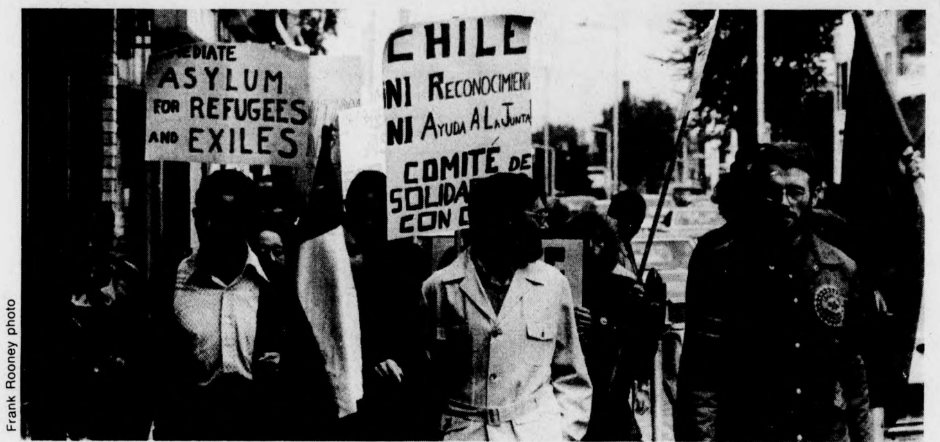
Students marched in Toronto and Ottawa protesting the military coup in Chile.