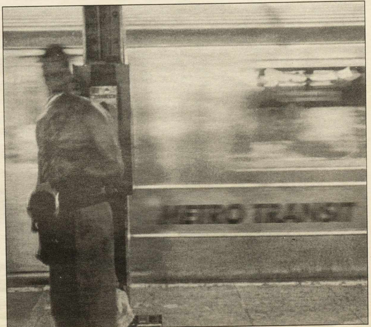
TIME IS MONEY: 30 minute Spring Garden stroll will be reduced to an efficient 25 minutes by subway. Fares expected to start at just $35. single rate.