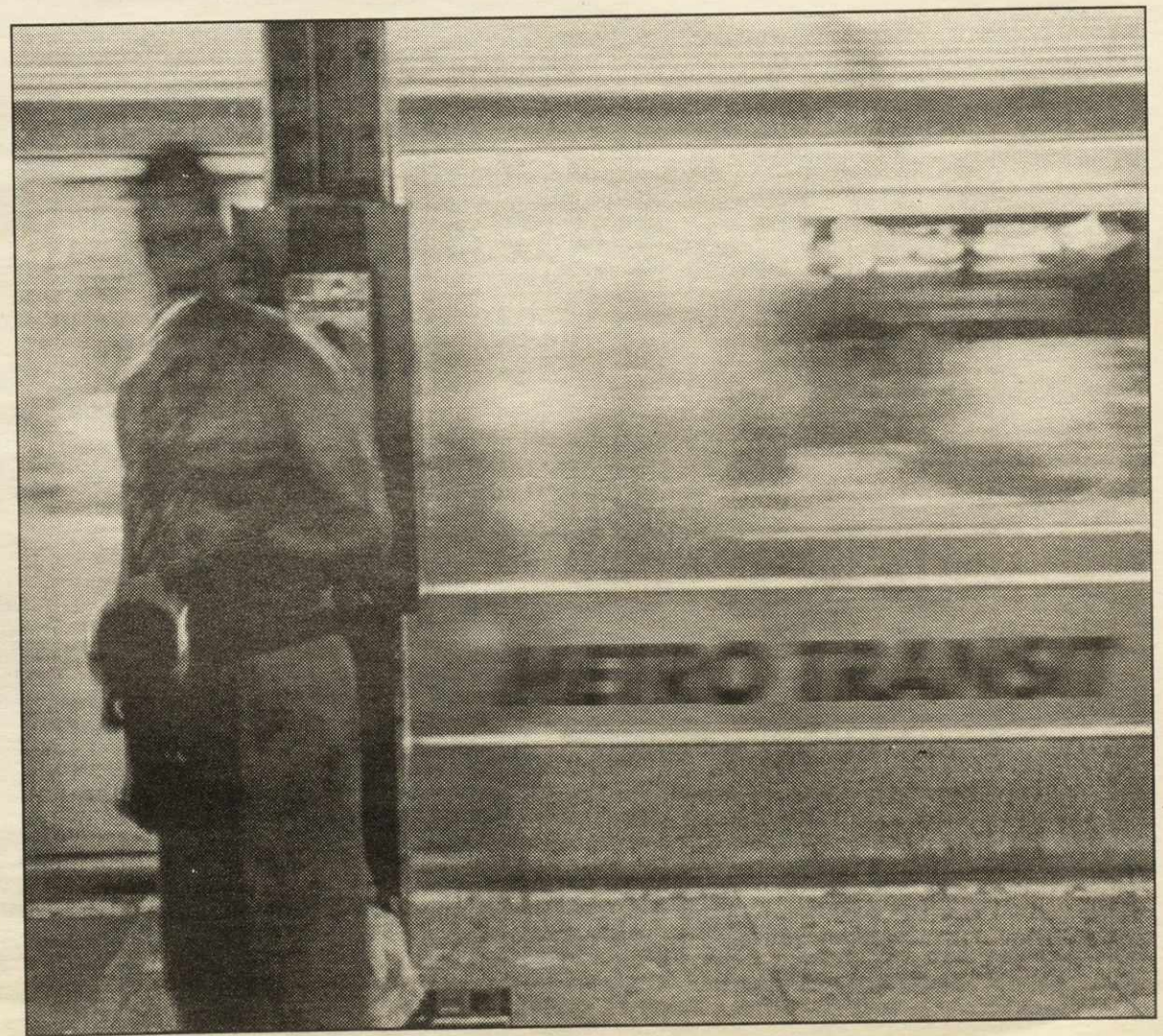
TIME IS MONEY: 30 minute Spring Garden stroll will be reduced to an efficient 25 minutes by subway. Fares expected to start at just $35. single rate.