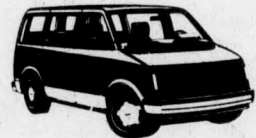
GMC Safari Passenger Van