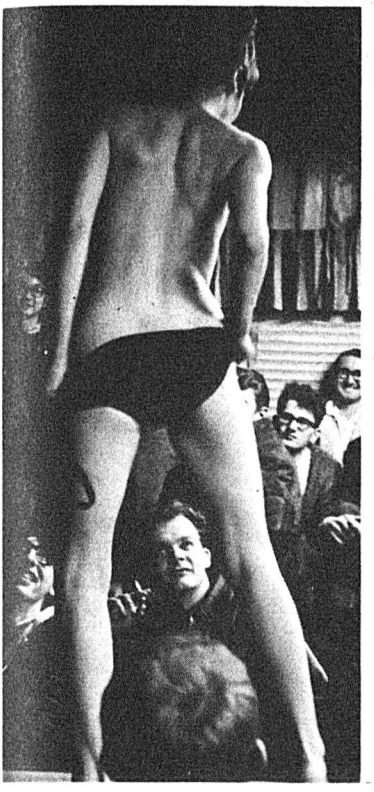
A GROUP of young engineers get their first look at a genuine nude female form at an engineering seminar during