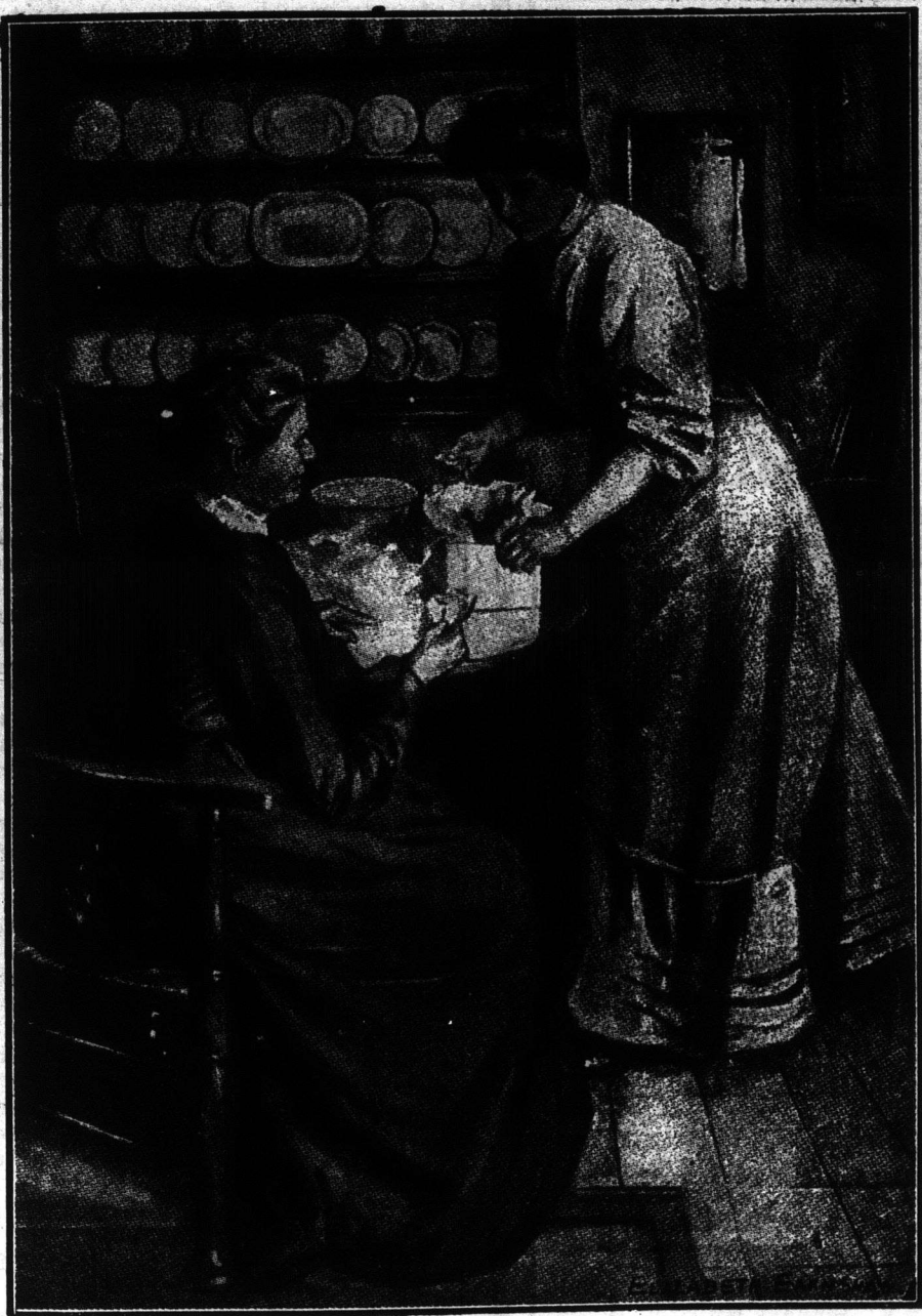
Then they laid in the Pieces.

"How would one of the samplers do?" queried her mother eagerly, "they're rare nowadays, and we've got grandmother's and Aunt Bathsheba's and Mrs. Kent's mother's, too. Don't you believe they'd prize one of those in the