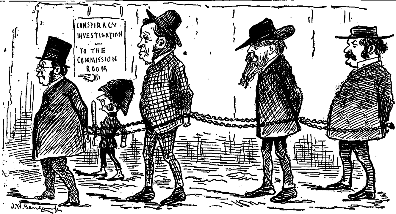
THE CONSPIRATORS ON THEIR WAY TO TRIAL.

(From suggestions by the Editor of the Mail.)