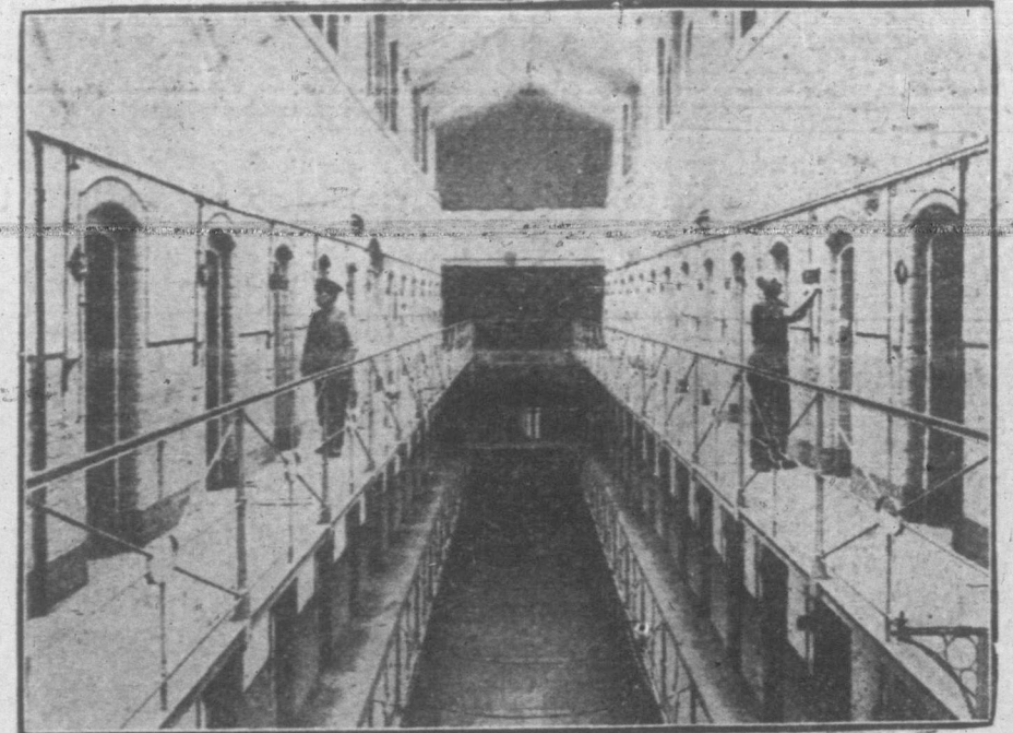
To solve the housing problem, Chemsford Town Council suggests renting cells in the local prison. The only difficulty is that the building must be always ready to revert to its original uses, and thus no structural alterations will be possible.