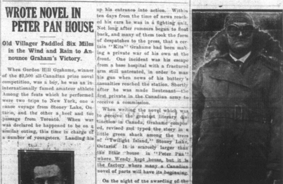
An Official Bird

ouldn't read." said the woman. After a stunned moment Shangi essy rocked with mirth-and wrote a check for the value of the illiterate